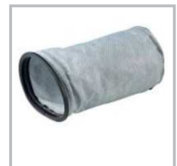
Washable Cloth Bags #HPV-BACK-CLTH BAG