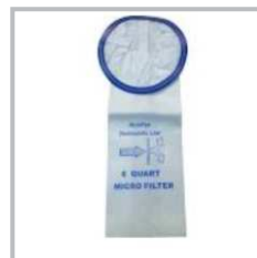
Disposable Paper Vacuum Bags #HPVA005-3