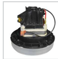
Powerful 1-Stage Motor